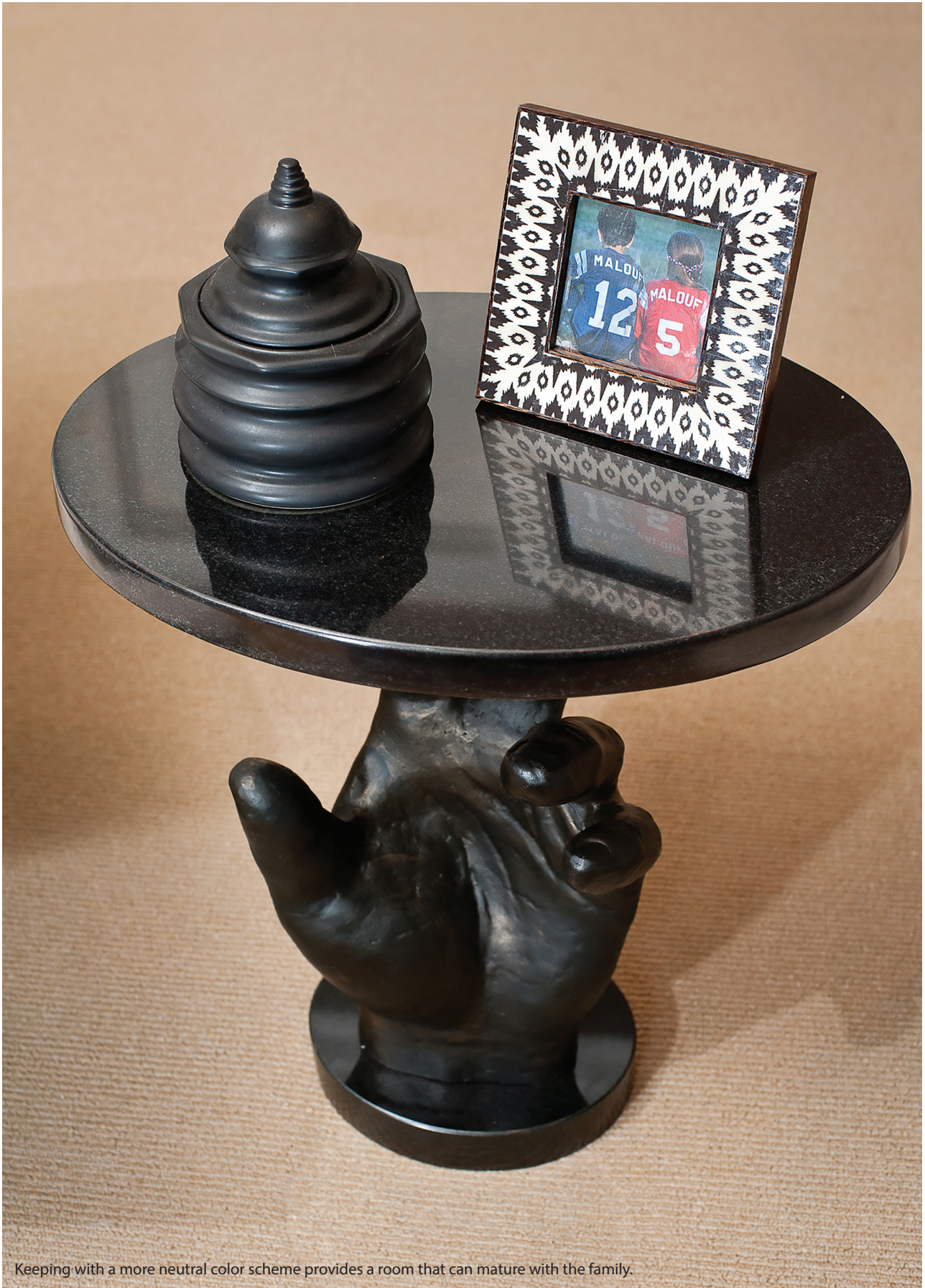
Keeping with a more neutral color scheme provides a room that can mature with the family.